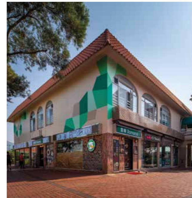
Major upgrade of the the shopfront facade to increase its visibility and accessibility

The next upgrade was the overall exterior of the blocks, as there were previously many blank walls and a long parapet wall that created a stale atmosphere. As part of the Town Centre's 'Green and Nature' theme to reflect its outdoors setting, the custom-designed geometric green patterns painted on each block added visual interest and a feeling of freshness and variety to the premise. The long parapet wall was also concealed by real bamboo planters, which created a natural green wall, further strengthening the theme.