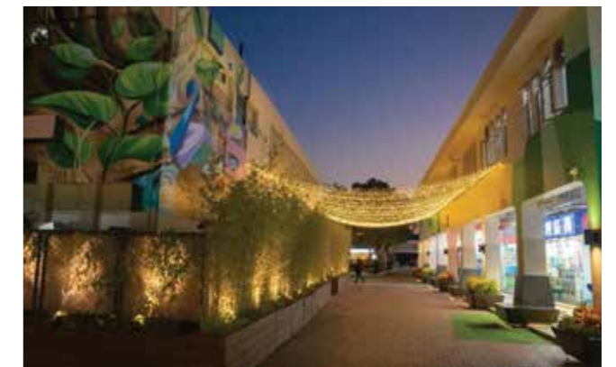
The overall exterior of the blocks is concealed by real bamboo planters and lighting features

In conclusion, the major renovation and repositioning was successful to improve the image of the area, as well as to retain customers and encourage them to shop at the Town Centre. There is a new energy and freshness where residents find it more pleasant to visit, and the Town Centre should continue to thrive as an anchor destination for the larger community. 🌱