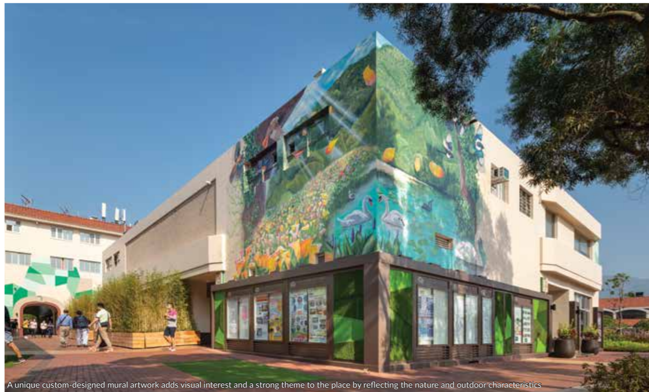
A unique custom-designed mural artwork adds visual interest and a strong theme to the place by reflecting the nature and outdoor characteristics